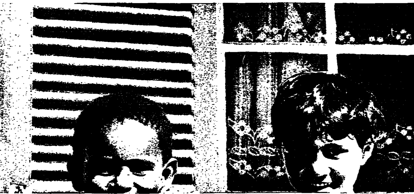
Asian and black children at play in Cape Town -- What does the future hold for them?